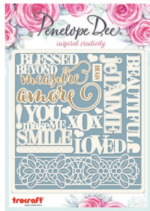
PD4360 WORD SENTIMENTS